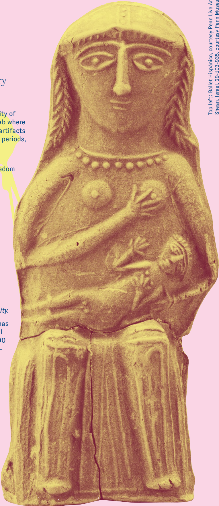
Top left: Ballet Hispánico, Right: Figurine, Beth Shean, Israel, 29-103-935