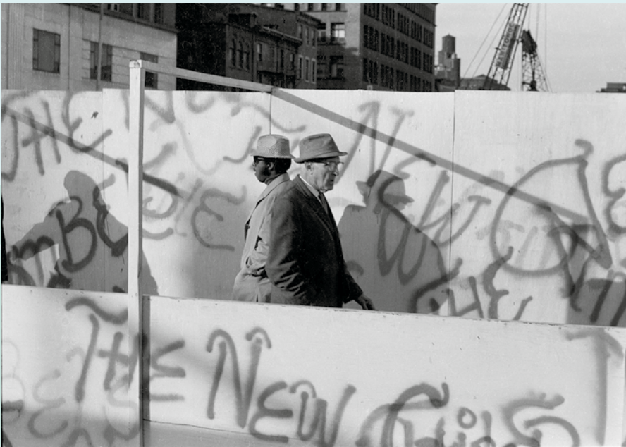
Top: Laurence Salzmann: A Life With Others Photograph by Laurence Salzmann. 8th and Market Streets, from City / 2 , Philadelphia, 1971.